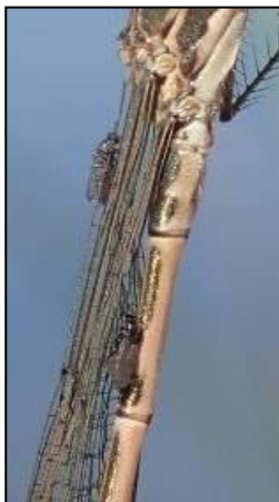
Figure 3. Two Forcipomyia paludis on Sympecma fusca on Öland Island in Sweden (L.29, Tab. 1).

Slika 2. Tri kačjepastirske mušate ( Forcipomyia paludis ) na krilih krvavordečega kamenjaka ( Sympetrum sanguineum ) (L.13, Tab. 1) (zgoraj levo), 15 na dristavičnem spreletavcu ( Leucorrhinia pectoralis ) (L.38, Tab. 1) (zgoraj desno), 35 na črnem ploščcu ( Libellula fulva ) (L.15, Tab. 1) (spodaj levo) in 12 na malem modraču ( Orthetrum coerulescens ) (L.12, Tab. 1) (spodaj desno).