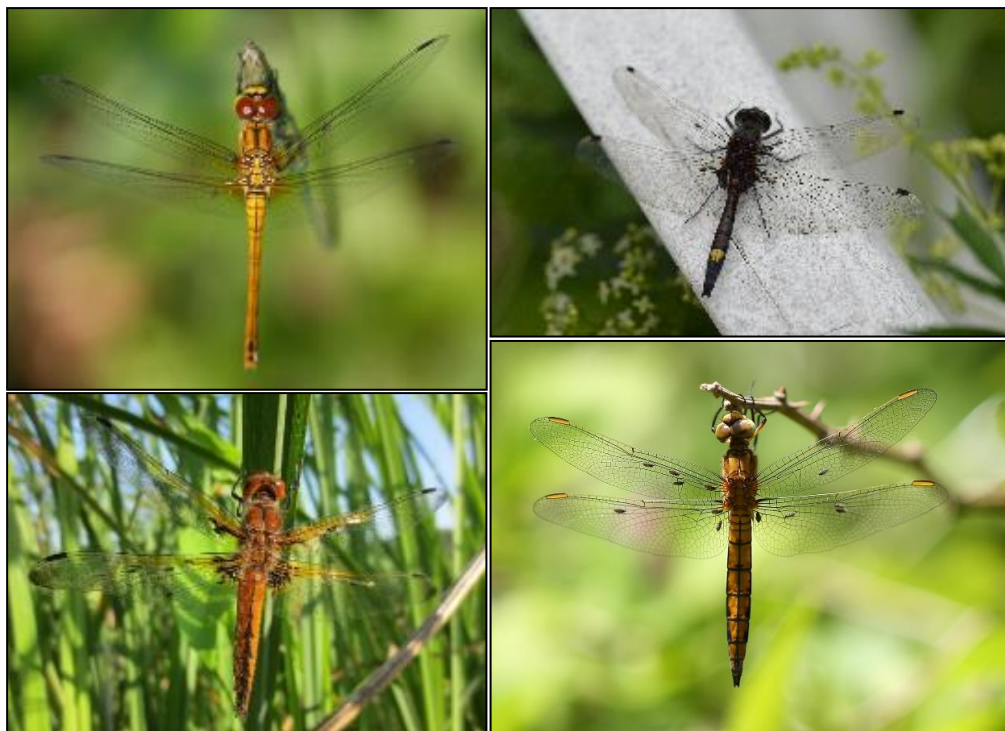
Figure 2. Three Forcipomyia paludis on Sympetrum sanguineum (L.13, Tab. 1) (top left), 15 on Leucorrhinia pectoralis (L.38, Tab. 1) (top right), 35 on Libellula fulva (L.15, Tab. 1) (bottom left) and 12 on Orthetrum coerulescens (L.12, Tab. 1) (bottom right).

Slika 2. Tri kačjepastirske mušate ( Forcipomyia paludis ) na krilih krvavordečega kamenjaka ( Sympetrum sanguineum ) (L.13, Tab. 1) (zgoraj levo), 15 na dristavičnem spreletavcu ( Leucorrhinia pectoralis ) (L.38, Tab. 1) (zgoraj desno), 35 na črnem ploščcu ( Libellula fulva ) (L.15, Tab. 1) (spodaj levo) in 12 na malem modraču ( Orthetrum coerulescens ) (L.12, Tab. 1) (spodaj desno).